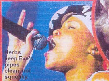
Herbs keep Eve's pipes clean, not squeaky.