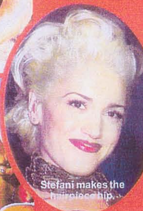
Stefani makes the hairpiece hip.