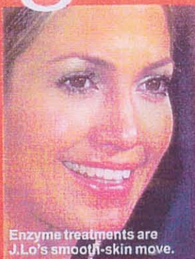
Enzyme treatments are J.Lo's smooth-skin move.

It takes more than talent to be a stage sensation. It takes style, stamina, a fake tan and the occasional $275 pair of undies.